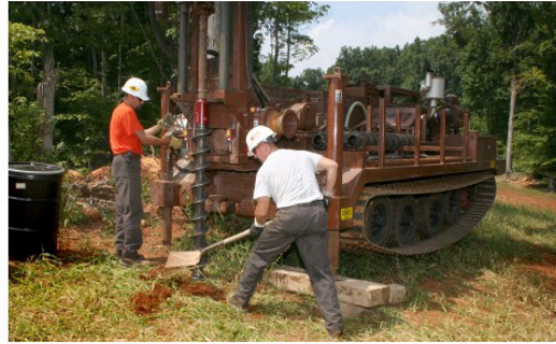
Monitoring Well Installation at Norfolk Naval Shipyard